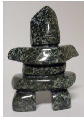
A model inuksuk similar in style to the Vancouver 2010 Olympic emblem. On display now in Raising the Totem .

Stretching along the coast of the Pacific Ocean from the Southern tip of Alaska through British Columbia, Washington, Oregon, and Northern California, the Northwest Coast is an area which has been home to diverse groups of indigenous peoples for over ten thousand years.